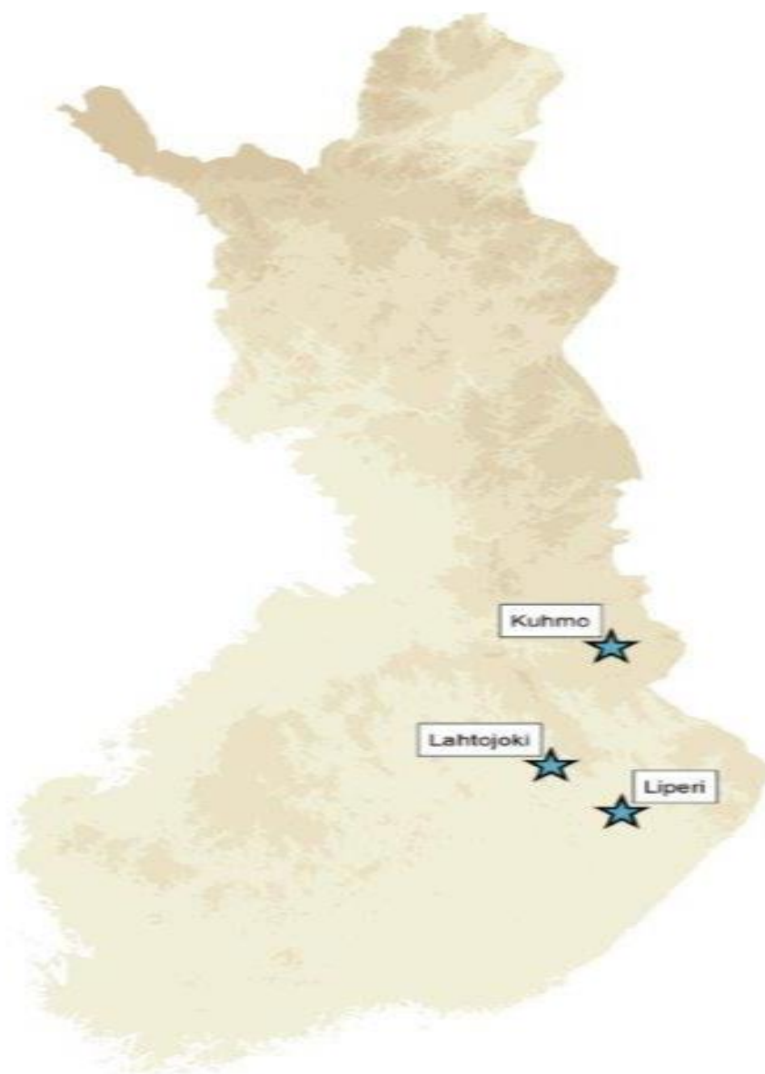
Exhibit 1: Location of Liperi in Finland